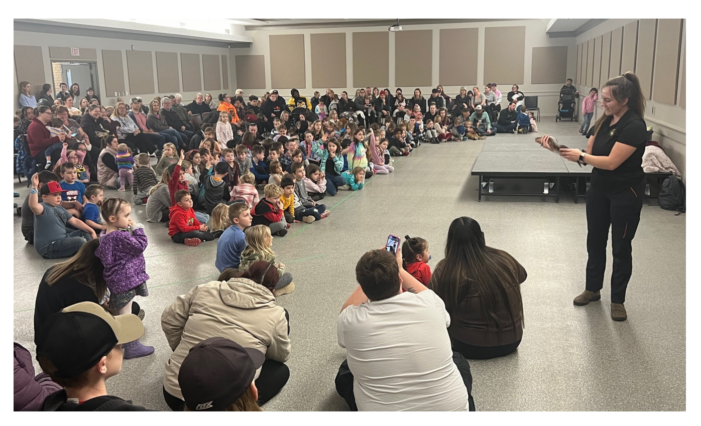
Ray's Reptiles program at the Shedden Library branch welcomed over 250 enthusiastic children and parents during March Break