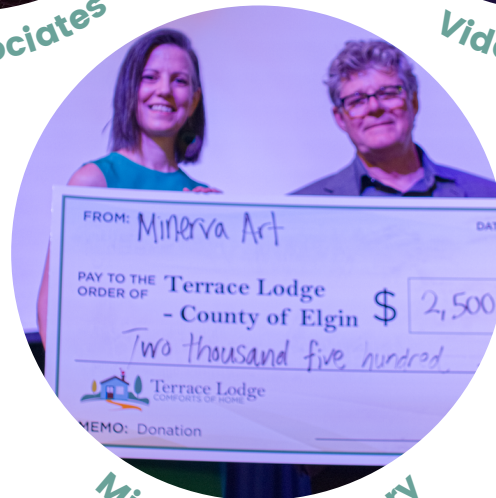
Minerva Art Gallery