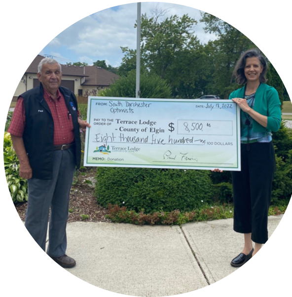
South Dorchester Optimist Club