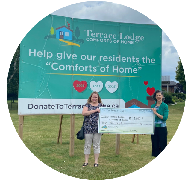
St. Anne's Catholic Women's League