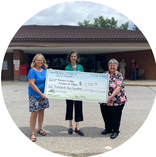
Mapleton Church of Christ Disciples