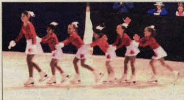
A group of skaters represents Canada's "Snow-birds".