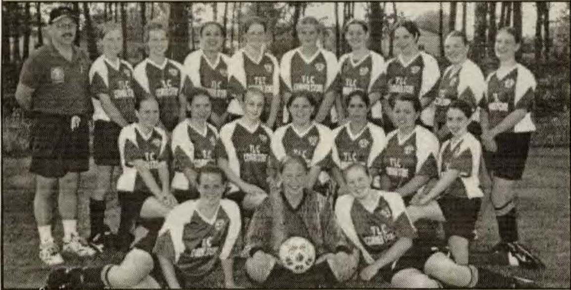
U16 A Girls (West Lorne) - Silver