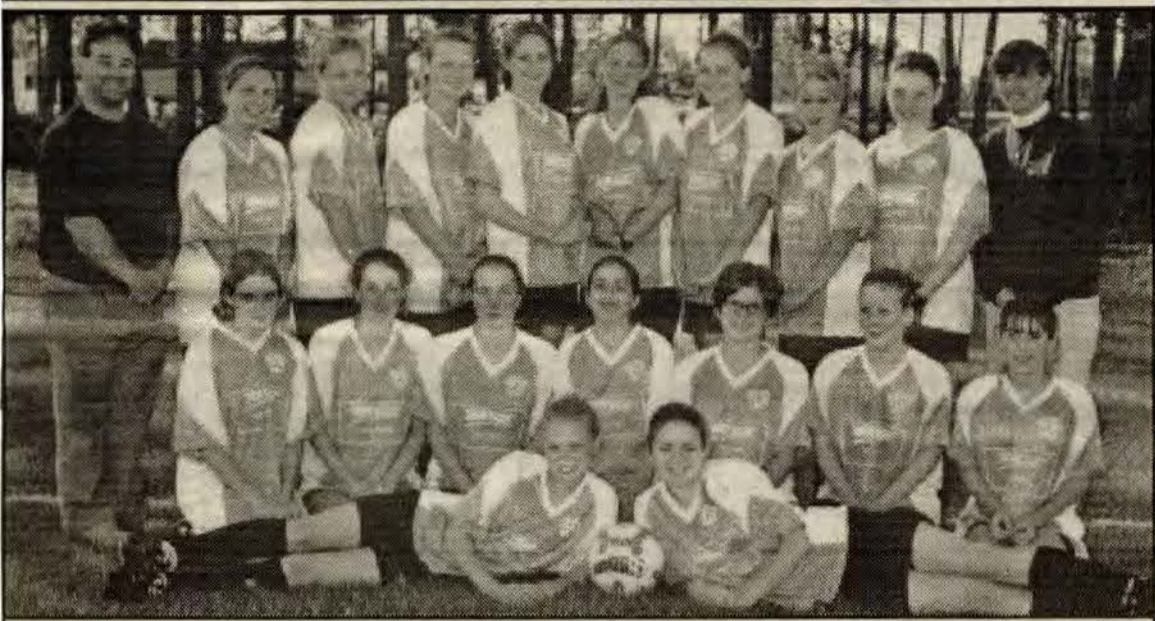
U16 B Girls (West Lorne) - Silver