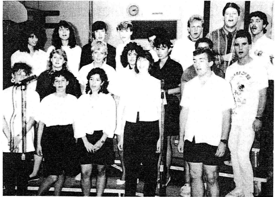
The WESS choir singing about "Good Vibrations" in 1988.