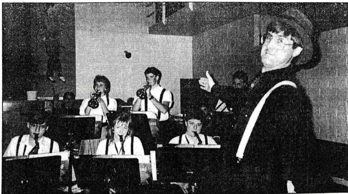
The WESS Jazz Band entertained at the 1990 WESS Fashion Show April 12. The band played selections such as My Funny Valentine by Richard Rodgers and Minnie Mouse Meets Min-