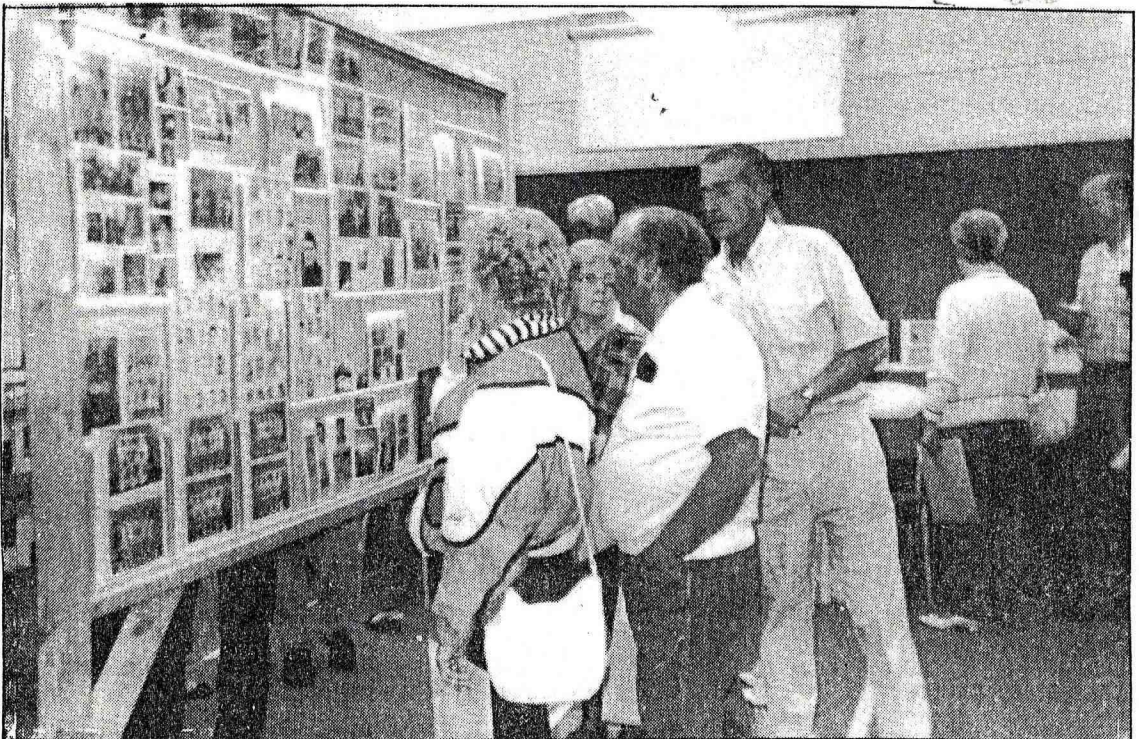
Memorabilia such as pictures, newspaper clippings, prom dresses, gymsuits, sweaters and awards from the different decades was on display in rooms at the high school during the WESS 40th Anniversary Reunion celebrations.