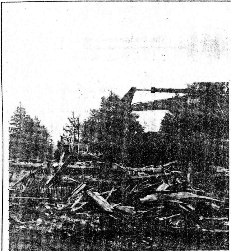
Down with the old and up with the new. Pictured here is the house beside the St. Mary's Church in West Lorne being demolished to make way for the new parish hall to be constructed.

cury, The West Lorne Sun, Wednesday, October 20, 1993 -- 3