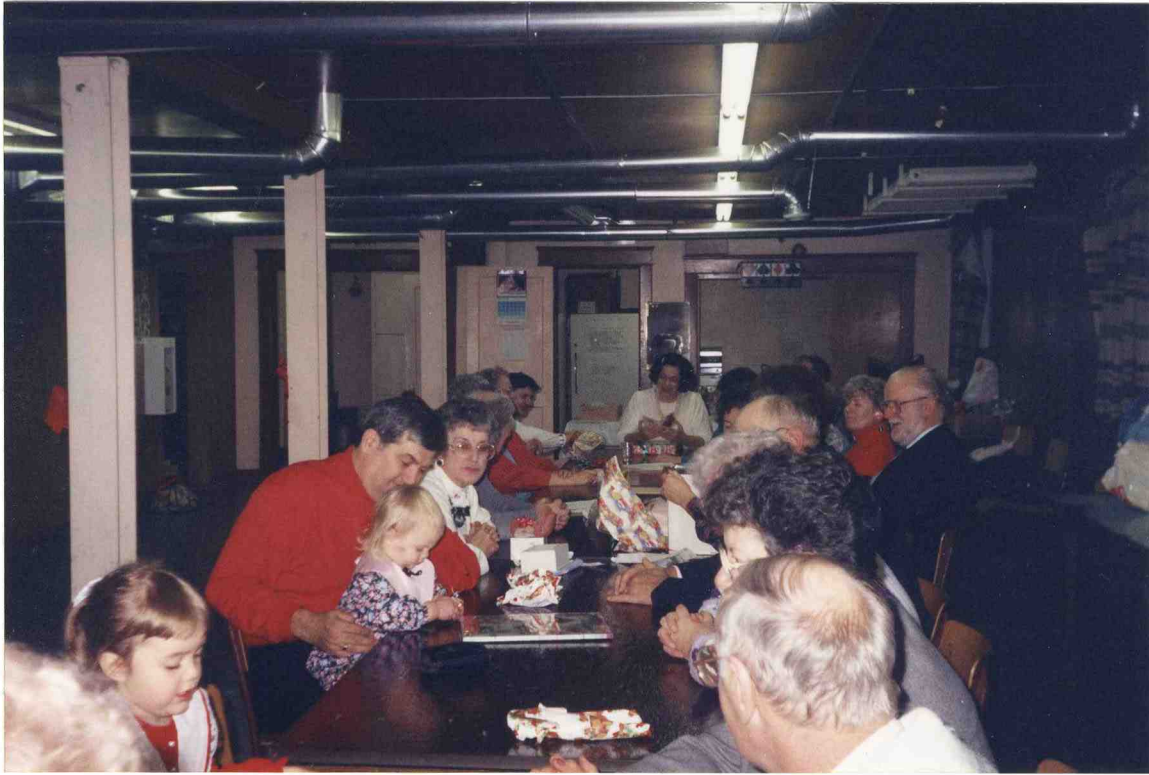
Family Christmas Party at Dec. meeting 1992