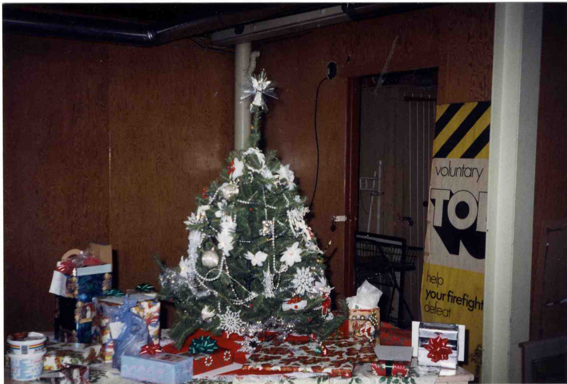
Gifts for secret pals are exchanged