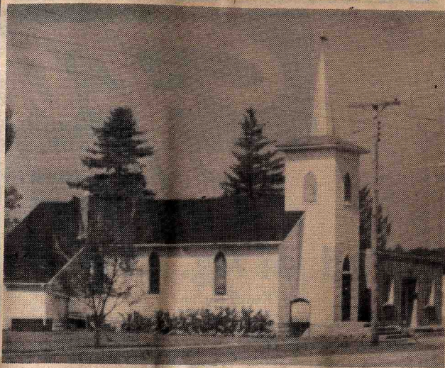
Grace Anglican Church

Other items of importance were discussed, and the Rector spoke of the possibility of having a mid-week Bible study with a Eucharist at Dutton and Port Stanley, if the people are interested.