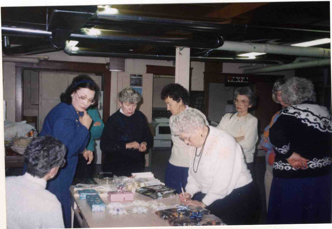
Ladies put a price on items for Dutch Auction at the Feb. 4 th , 1992 meeting.