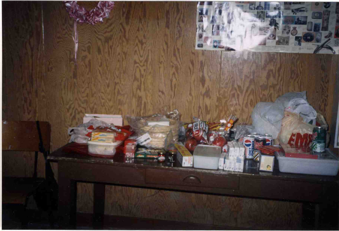
The table is loaded with food for the shut-ins.