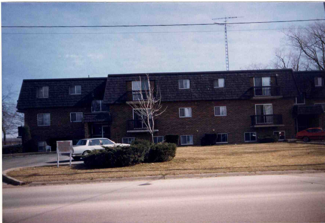
Senior Citizen Apartments built on the site of old West Lorne Public School.