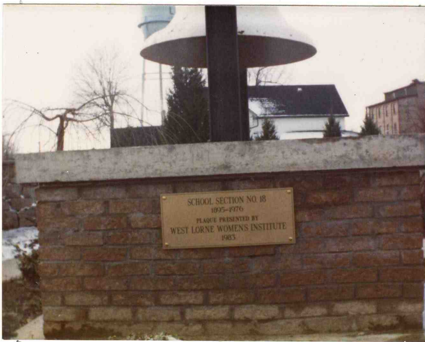
Bell from old West Lorne Public School Plaque was presented by the West Lorne W.I. in November, 1983.