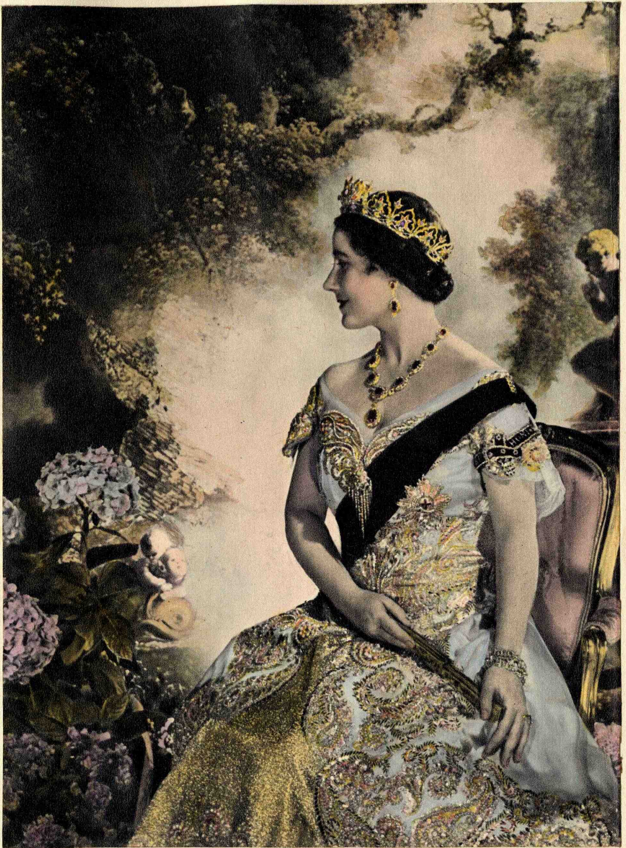
H.R.H. QUEEN ELIZABETH. A member of the Women's Institute.