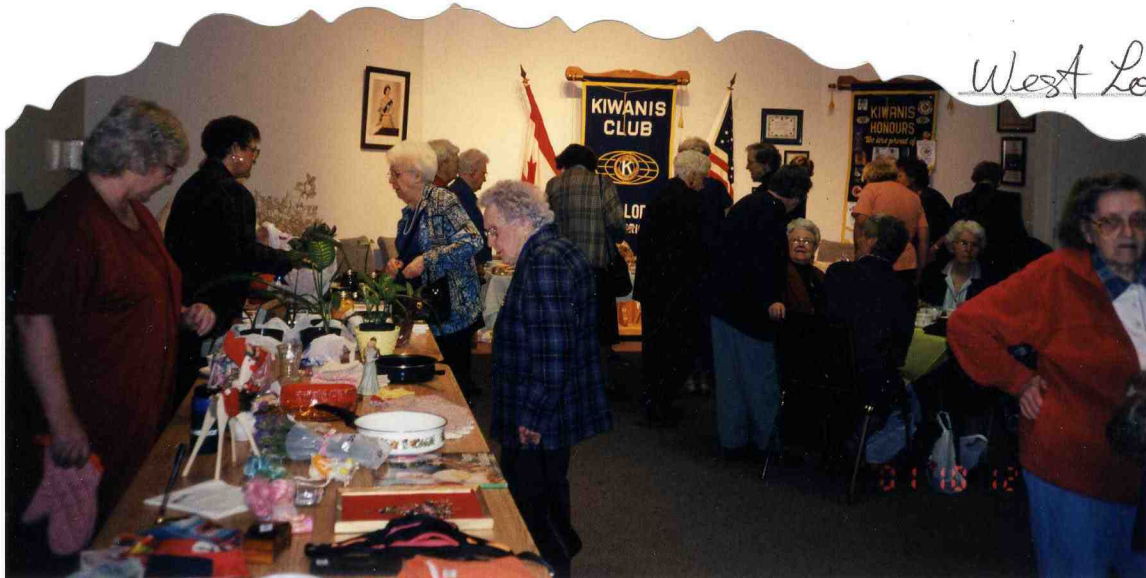
West Lorne Women's Institute put on the Daffodil Cancer Tea.