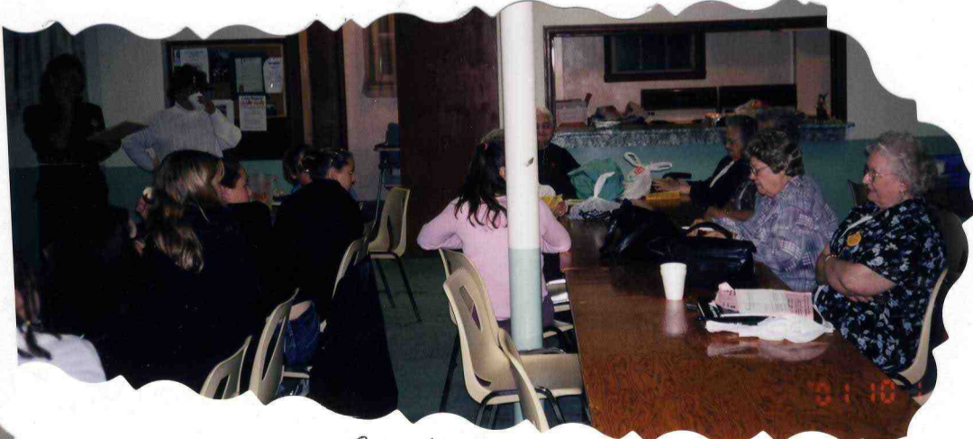
Wallacetown Women's Institute members having Hand cream Treatment.