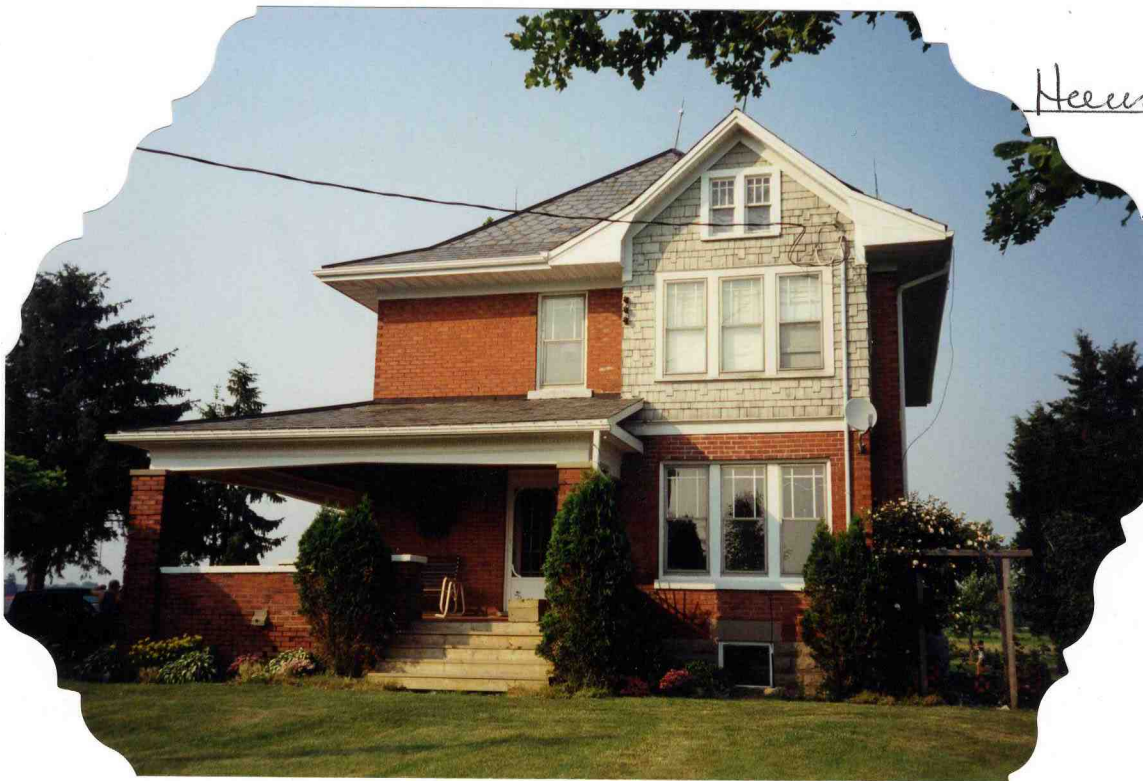
House Built about 1920.