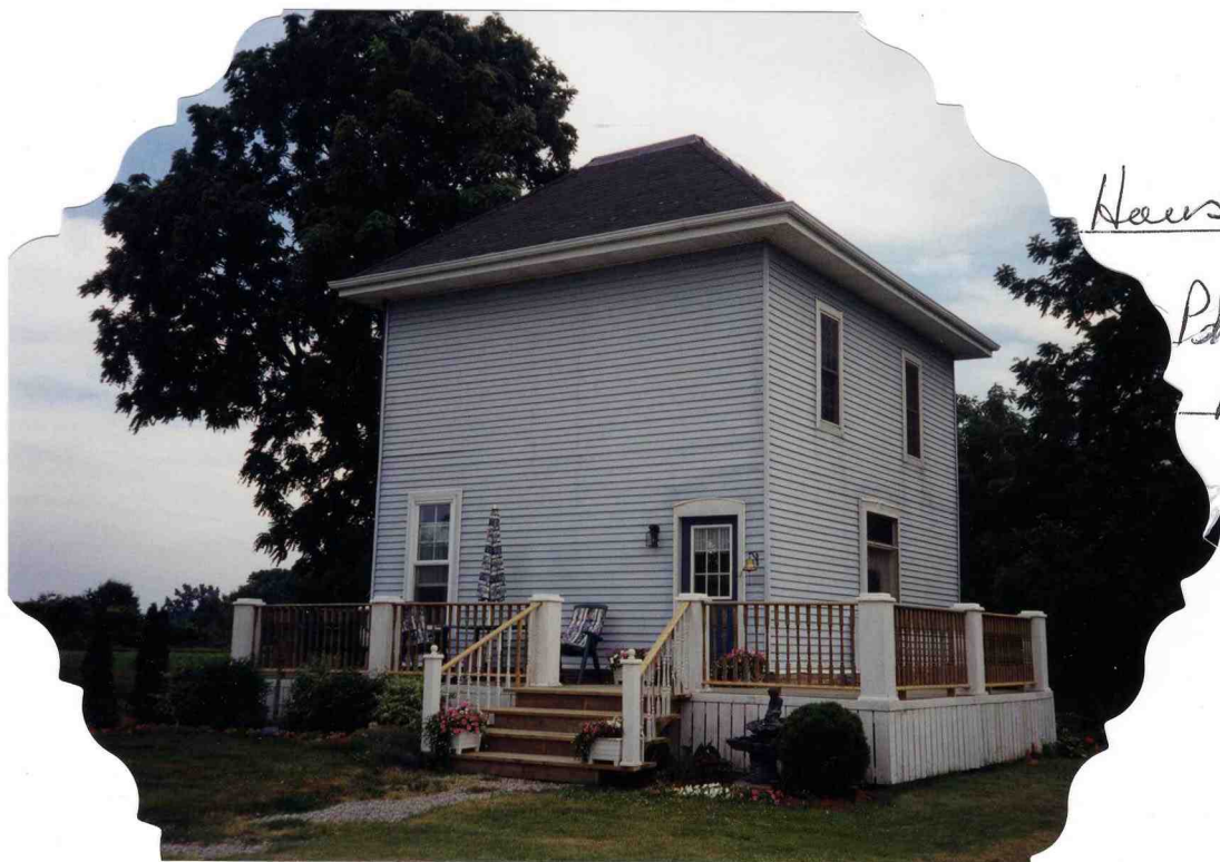
House built Late 1880: