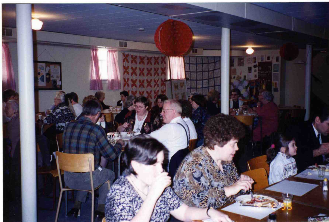
Breakfast, 9--10am, Served by the Men of the Congregation.