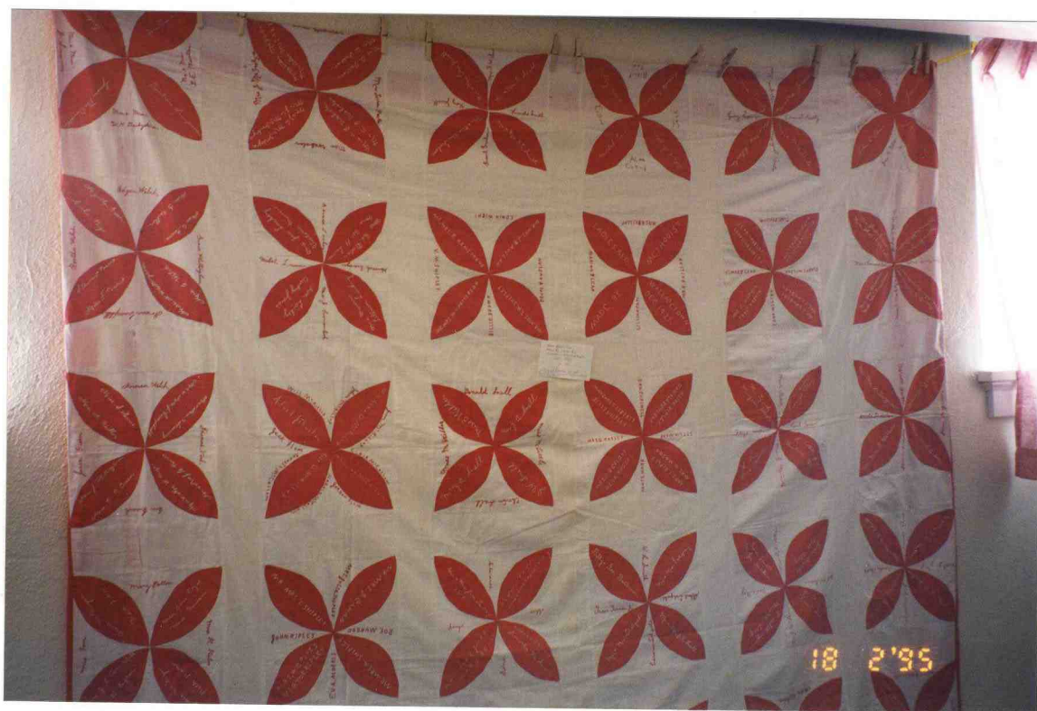
"Name Quilt Top".