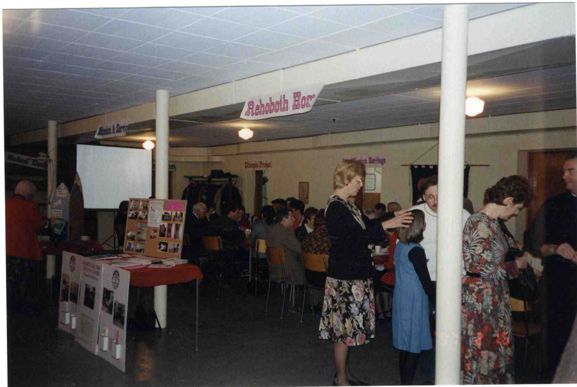
HERITAGE SUNDAY AT WALLACETOWN UNITED CHURCH ON FEBRUARY 16th 1997.