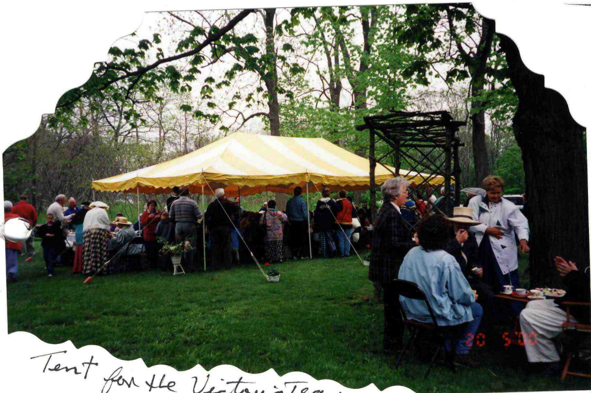
Tent for the Victoria Tea.