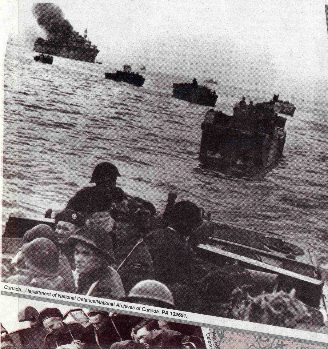
Canada. Department of National Defence/National Archives of Canada. PA 132651.

Special Supplement to The Times-Journal & Times-Journal Extra, Monday May 30th, 1994