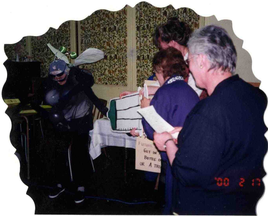
River Road Women's Institute.