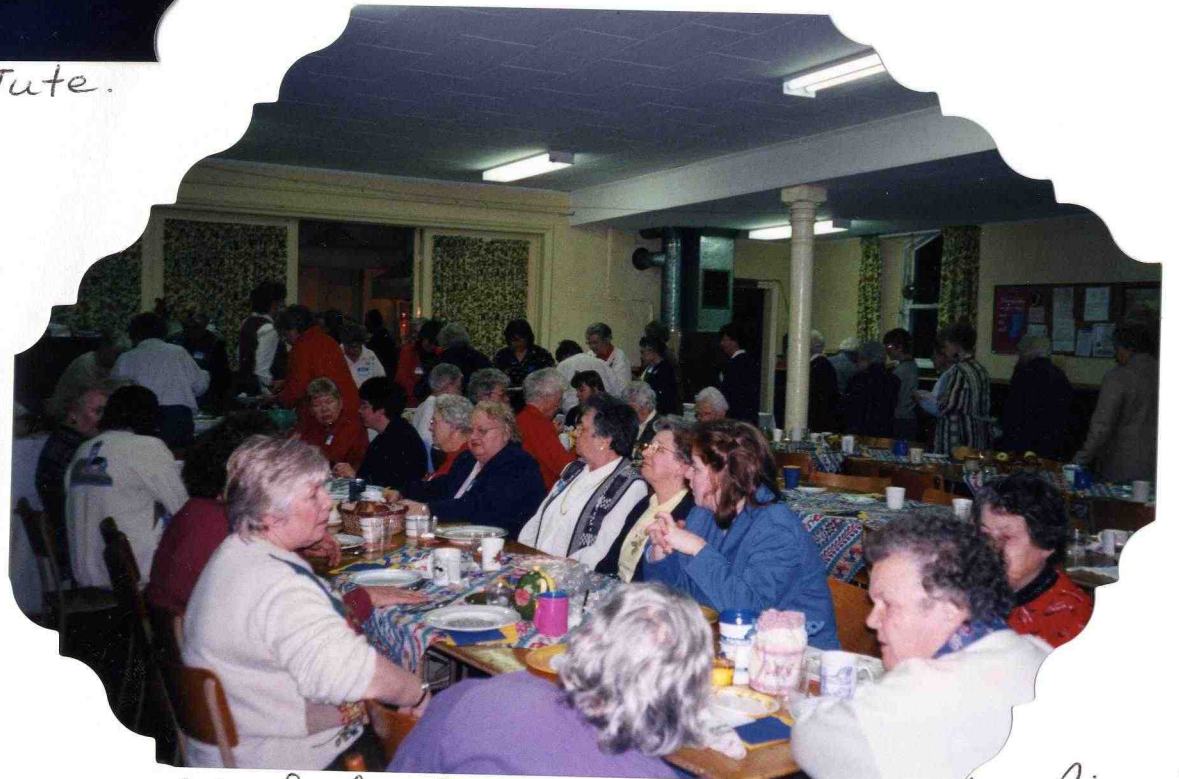
Pot Luck Supper at the Winter Picnic.