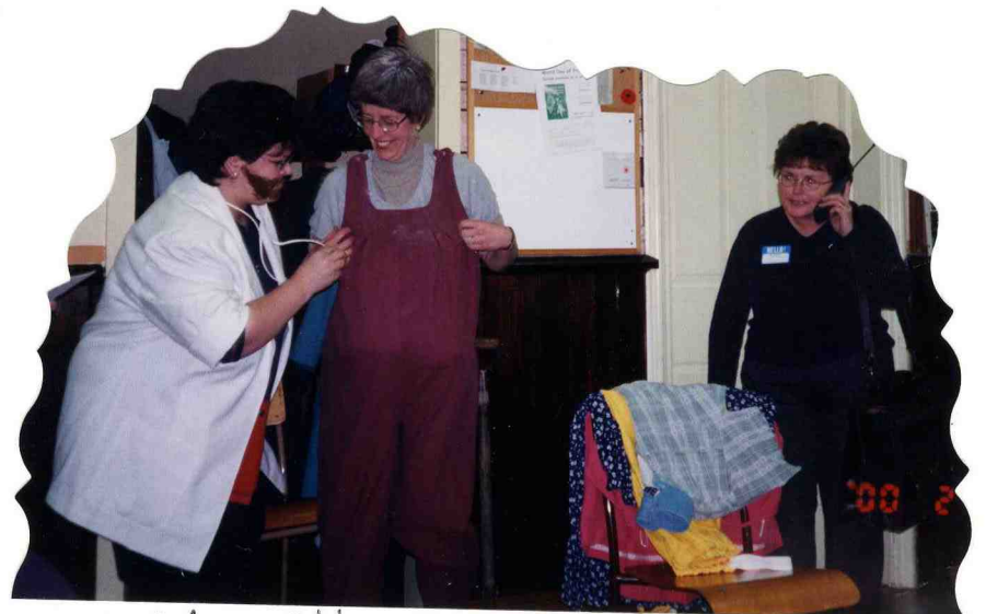
Shadden Women's Institute.