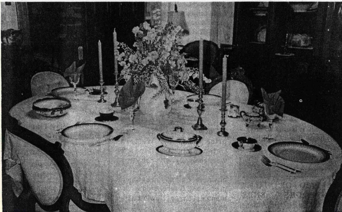
SPARKLING CRYSTAL – The original Tiffany chandelier hangs over the polished mahogany dining room table set with antique china and beautiful crystal. Guests are served a full breakfast prepared by host Danny Edwards.

The Victorian Court is located at 235 Main Street, Dutton. For more information contact Danny Edwards at 762-2244.