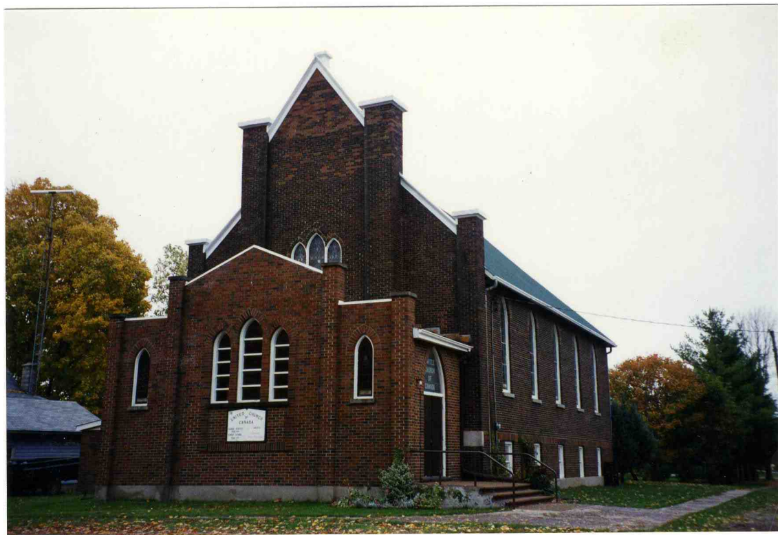
3. WALLACETOWN UNITED CHURCH. WALLACETOWN.