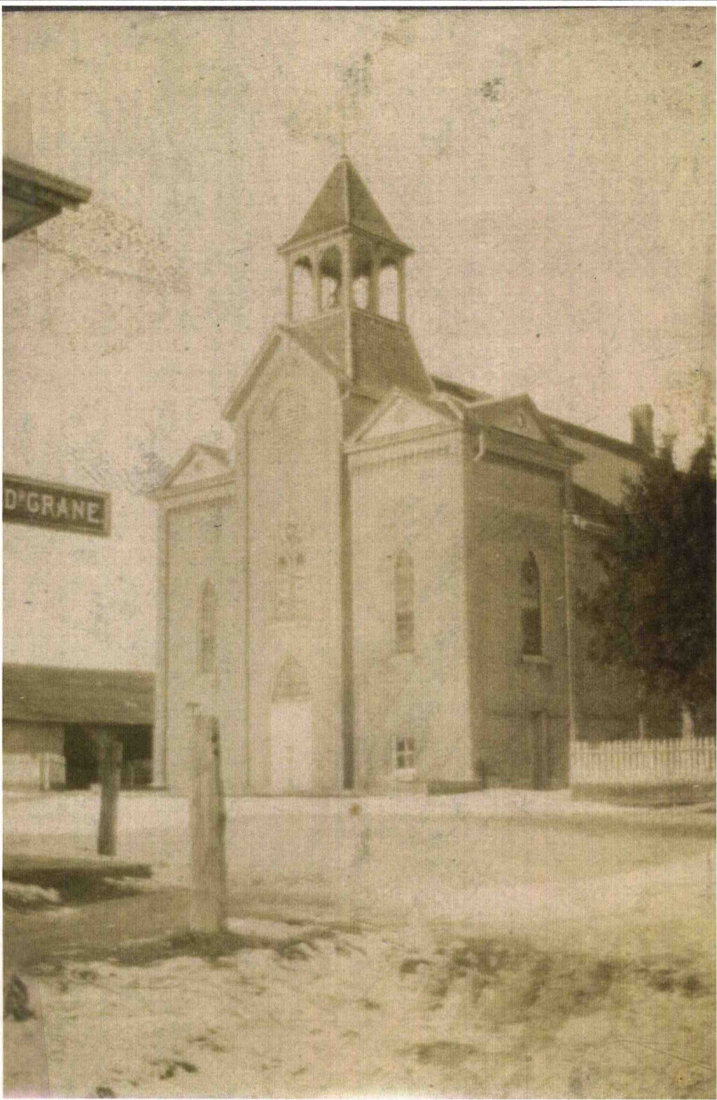
UP DATE ON THE THREE CHURCHES IN WALLACETOWN. PHOTO TAKEN OCT 1996. 1. ST ANDREWS PRESBYTERIAN CHURCH. WALLACETOWN.