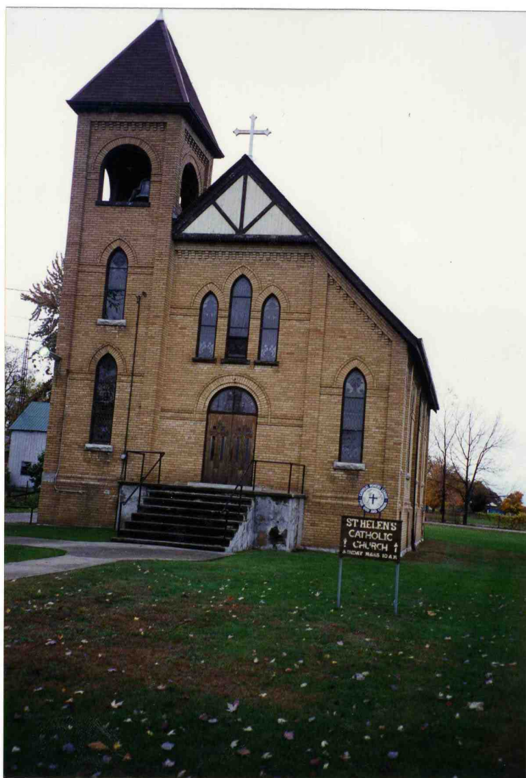
4. ST. HELEN'S CATHOLIC CHURCH. WALLACETOWN.