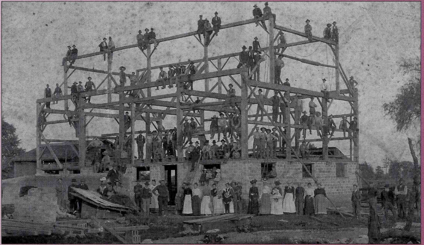
A barn raising in west Elgin in the 1890's.