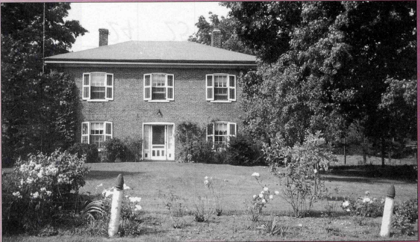
Backus-Page House in Dunwich Township built in 1850. Tryconnell Heritage Society are currently working to restore the home and open a museum and learning centre.