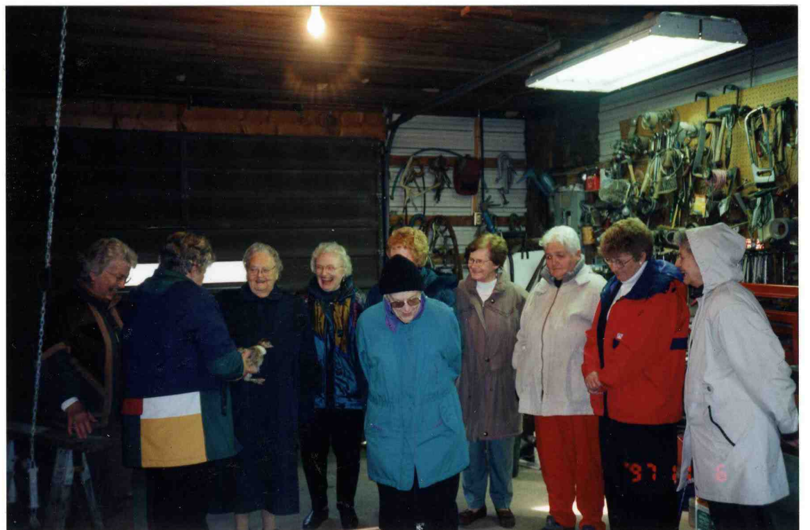
W.I. members looking at Ostriches.