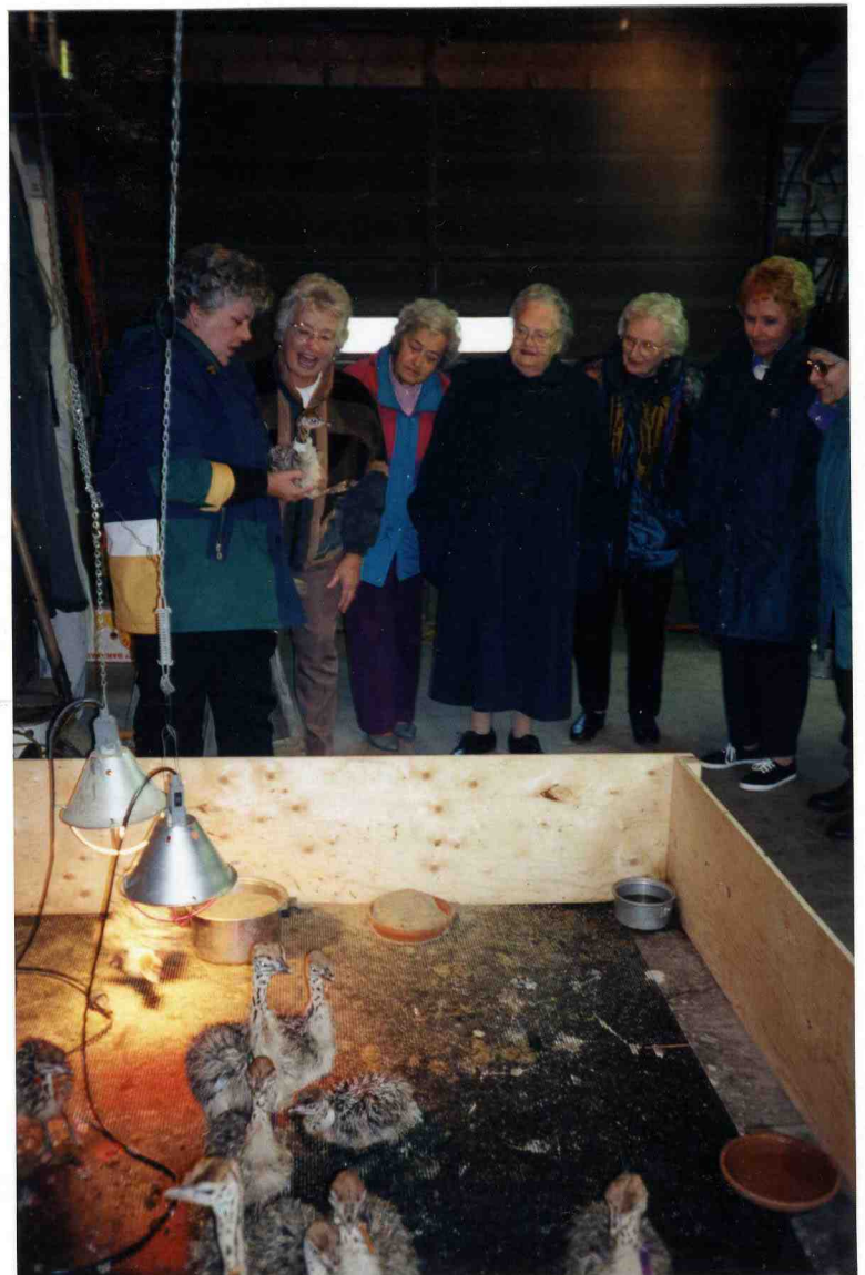
W.I. members looking at the baby Ostriches.