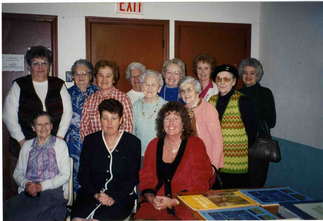
OFFICERS AND MEMBERS OF THE WALLACETOWN W. I. ANNUAL MEETING ON APRIL 6th 1995---1996.

A tasty lunch of hot cross buns and jam was served,