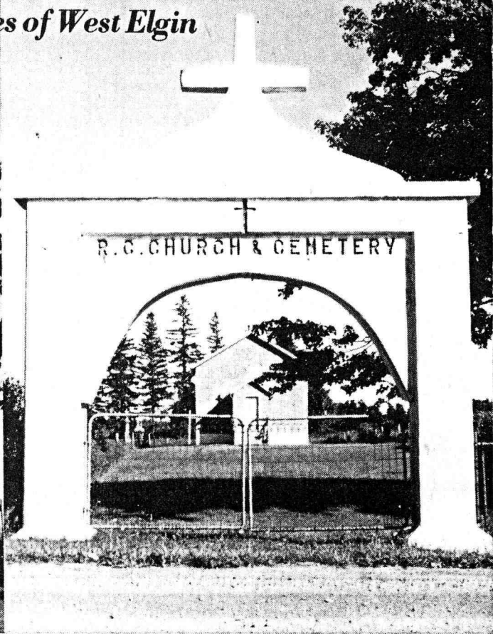
St. Henry's 1872 Middle St. Aldborough