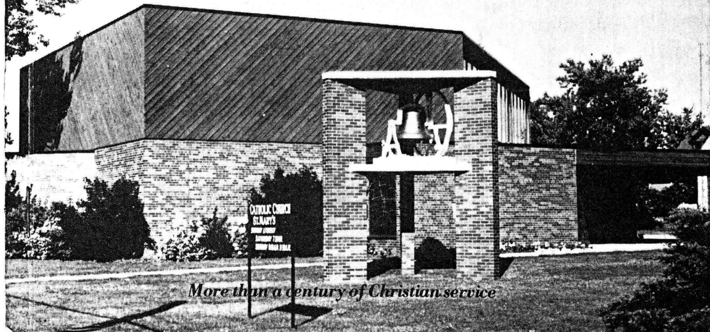
St. Mary's 1972 West Lorne

More than a century of Christian service