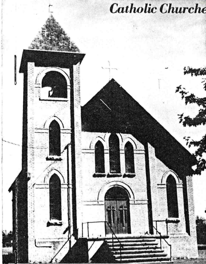
St. Helen's 1902 Wallacetown