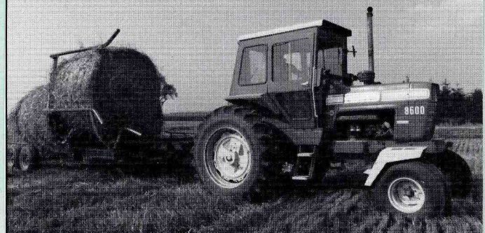
Modern haying is a mechanized operation.