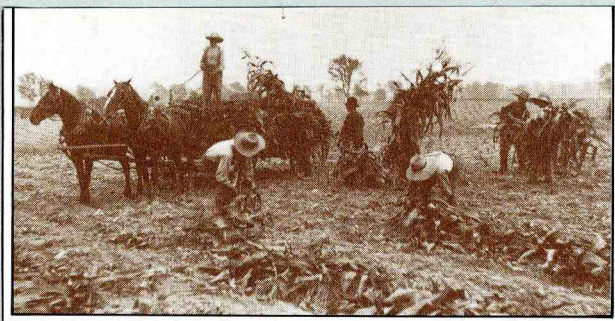
It took a crew of six to harvest corn in 1908.