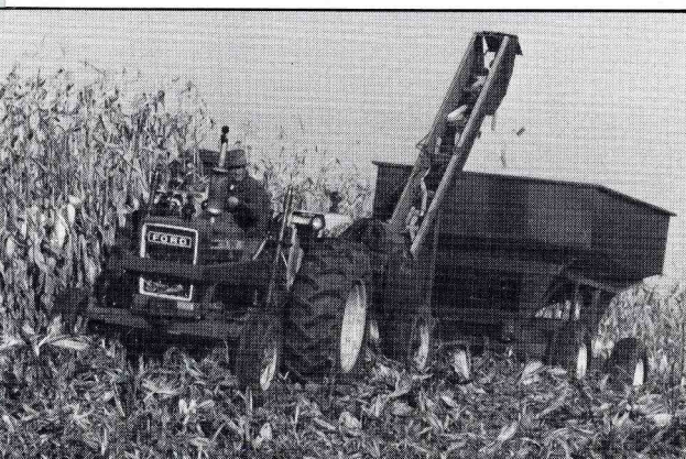
Today, harvesting corn takes one man, three machines.