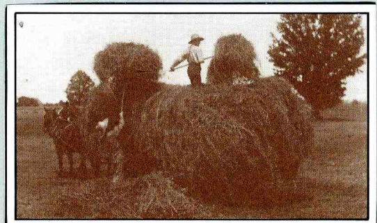
In 1900, haying was back-breaking work.