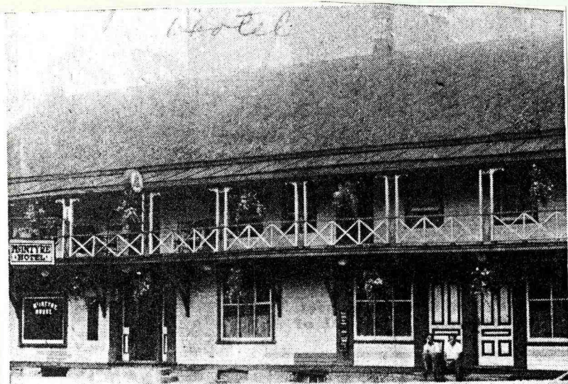
This postcard shows the McIntyre House Hotel in Dutton as it appeared in the 1930s.