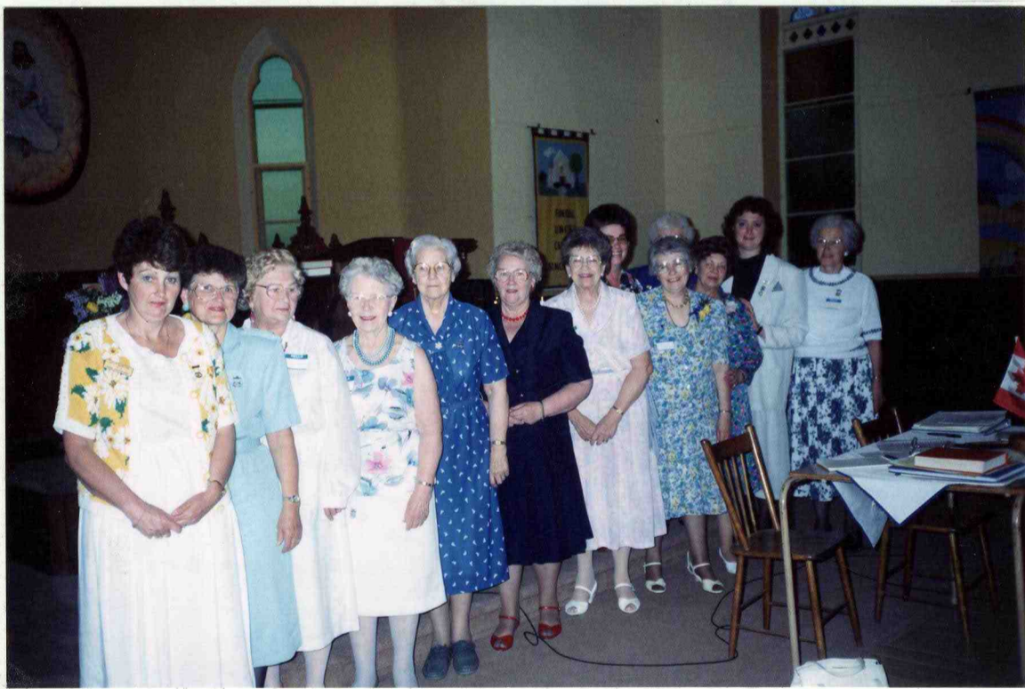
Officers installed at District Annual