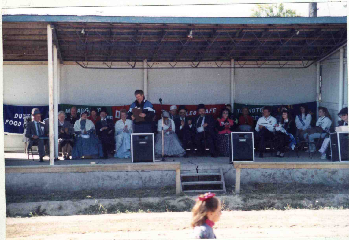
Sept. 28/91 - Official Opening of the Fair