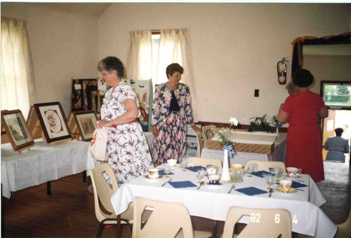
Photos of 80 th Anniversary of Wallacetown Women's Institute AT Wallacetown Community Hall.