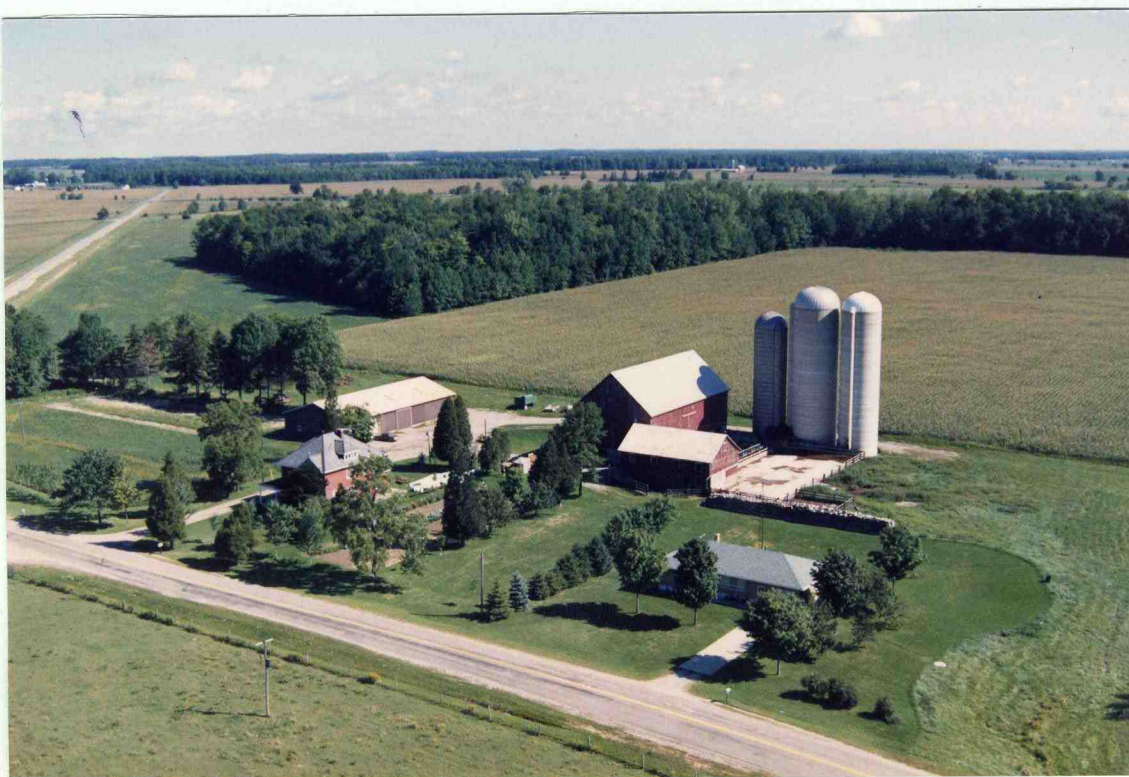
1990's aerial view of both homes and barns.