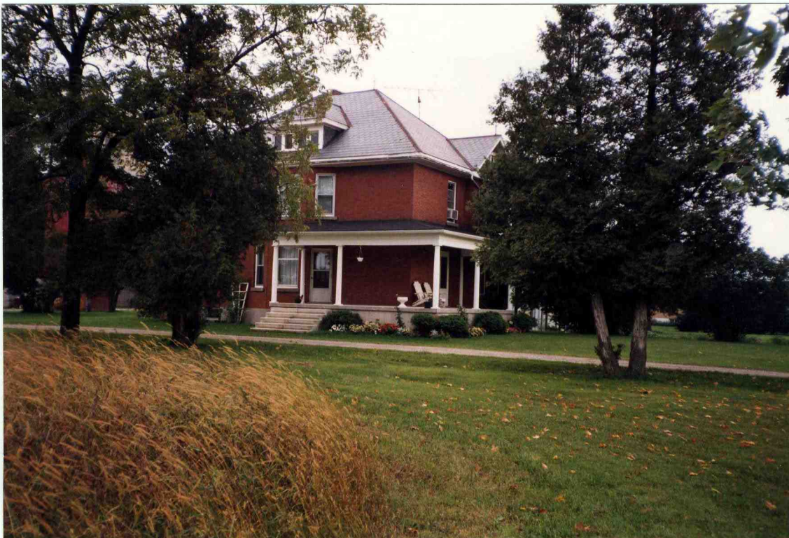
1990 view of The House.