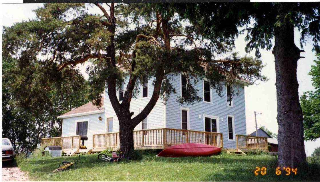
Photo taken 1994