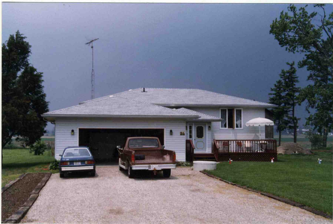
35 Talbot St. Owned by Leunis & Wilma Cardol. Built in 1990.