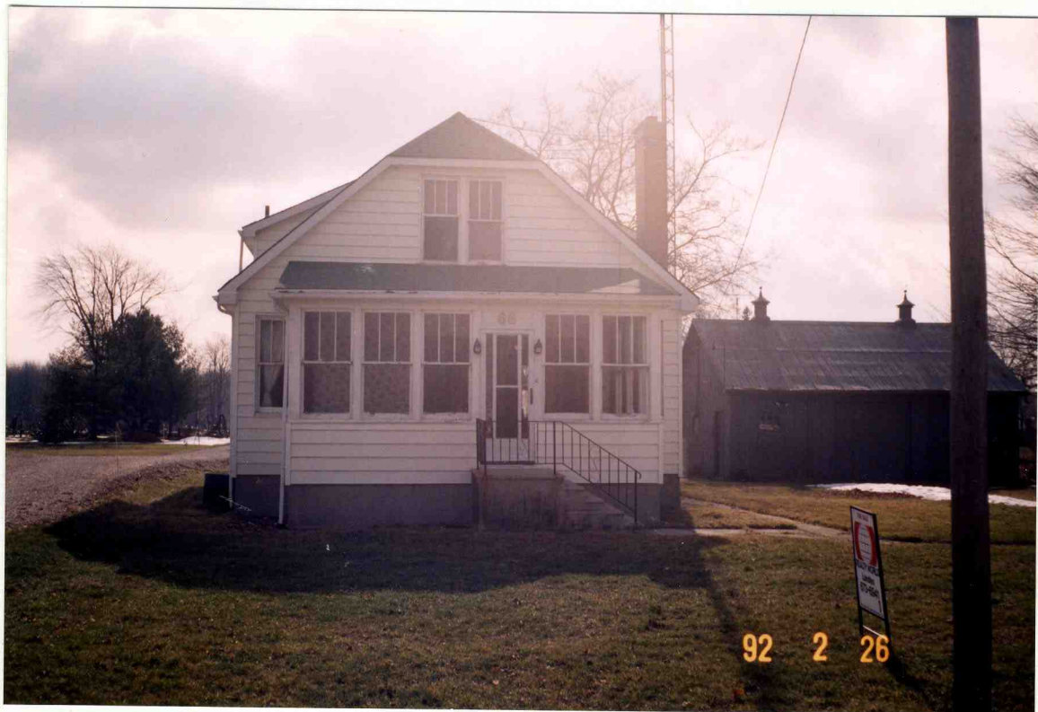
66 Talbot St owned by Bruce & Deirdre MacLeod. Built in 1900.