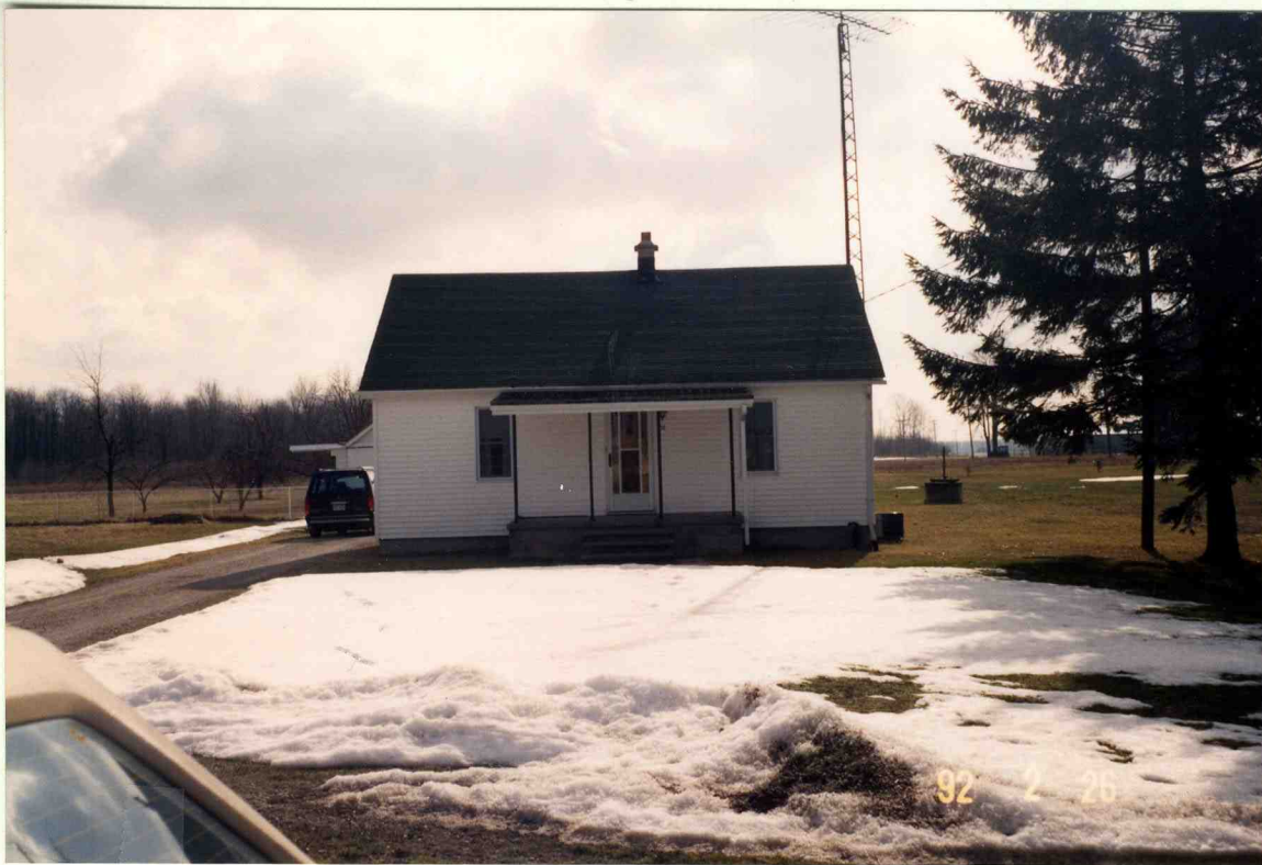
72. Talbot St owned by Mervyn Foreman. Built in 1900