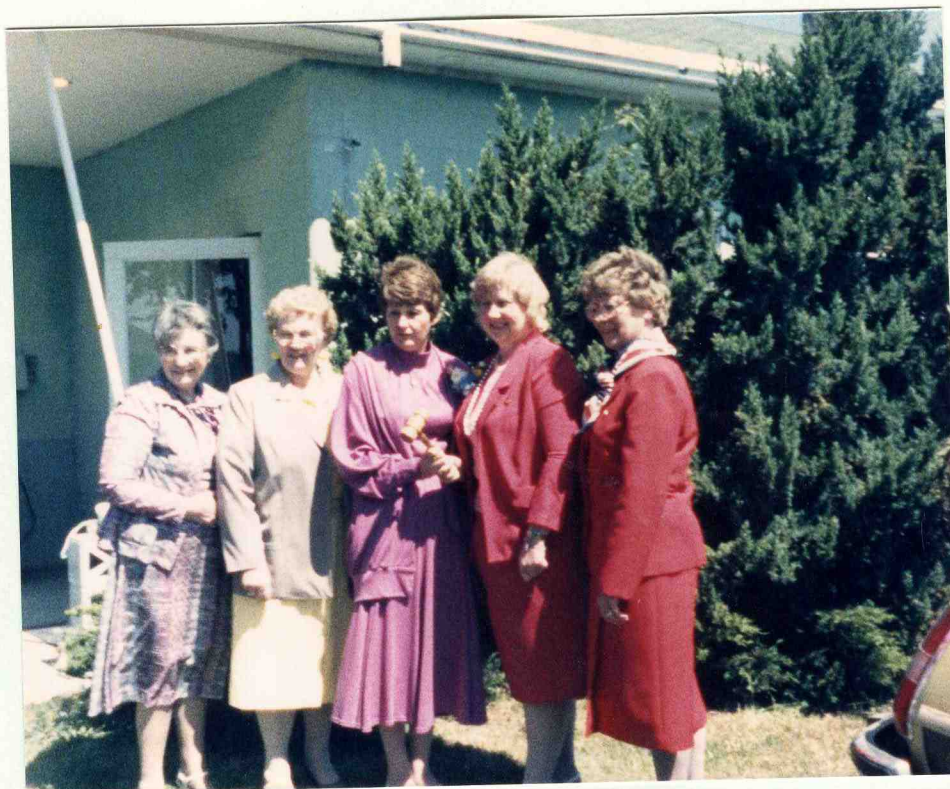
Officers for 1987-88.