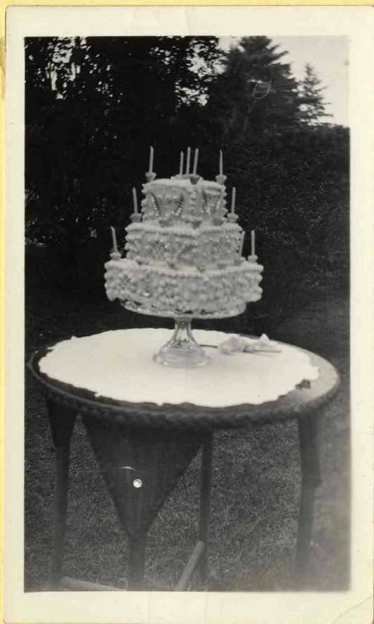
W.I. 25 th ANNIVERSARY CAKE. 1937.