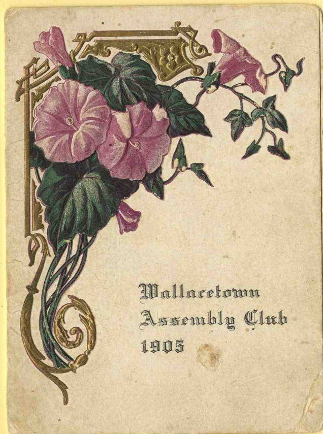
AN INVITATION 1905.