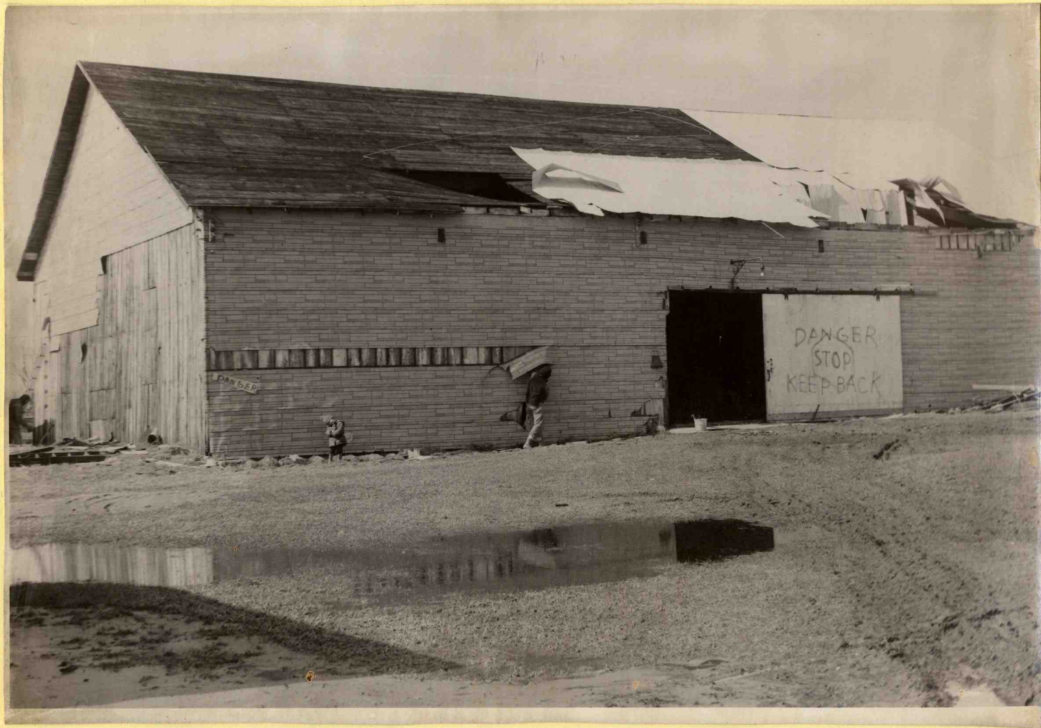
DRILL SHED DISAPPEARS - This structure which has served as an exhibits building at Wallacetown Fairgrounds for well over 100 years is in the process of being torn down. Originally erected as a drill shed for the anadian Militia at the time of the Fenian Raids it will be replaced by a steel pole building.