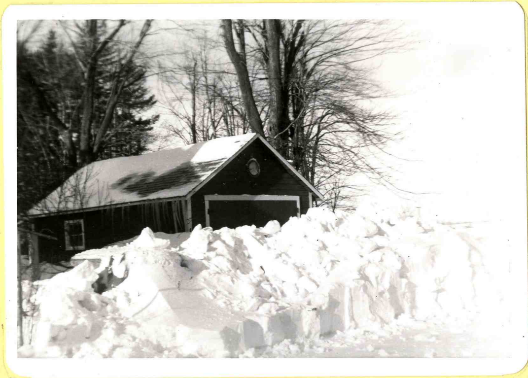
Snow banks at Scalias Garage- Feb. 12, 1977