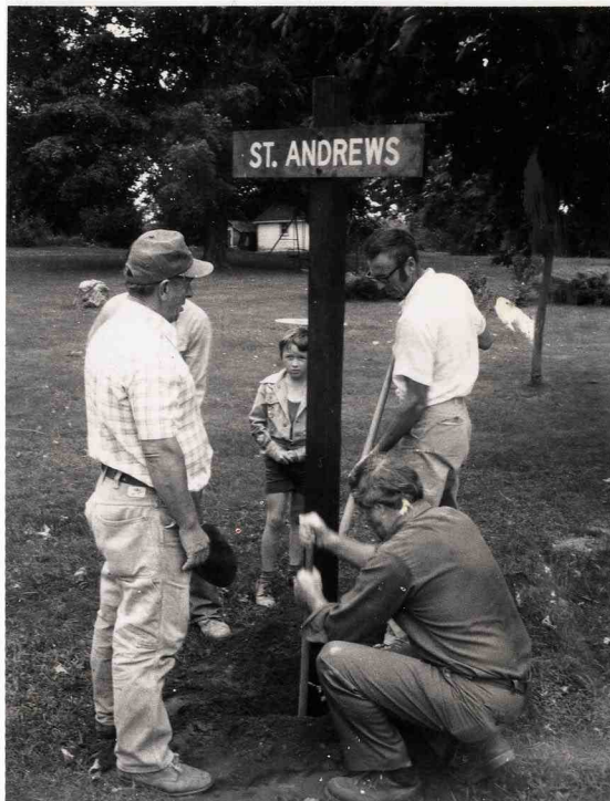
The Members of the Optomist Club erecting street signs in Wallacetown.