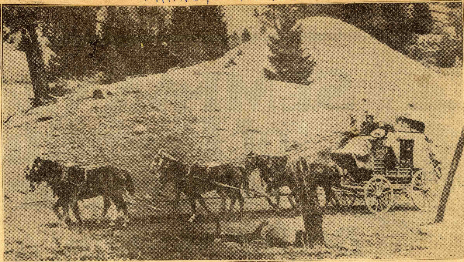
When the stage coach passed through WALLACETOWN AND Talbot Road

Stanley and St. Thomas. There were two roadhouses in the early days where a man might find rest and food and refreshments. One was Parker's Tavern, on the Talbot Road, Lot 16, Concession 10, Dunwich; the other was Coyne's Tavern, at Coyne's Corners, Talbot Road, Lot 16, Concession 8.