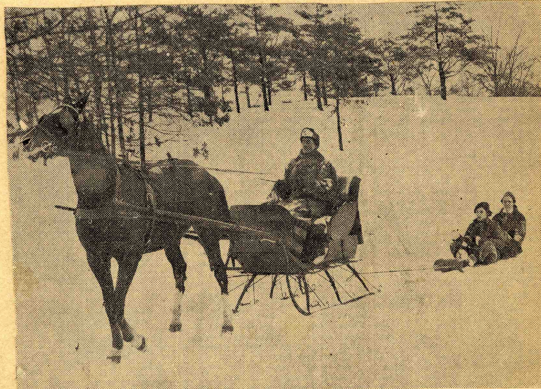
Tobogganing DE LUXE