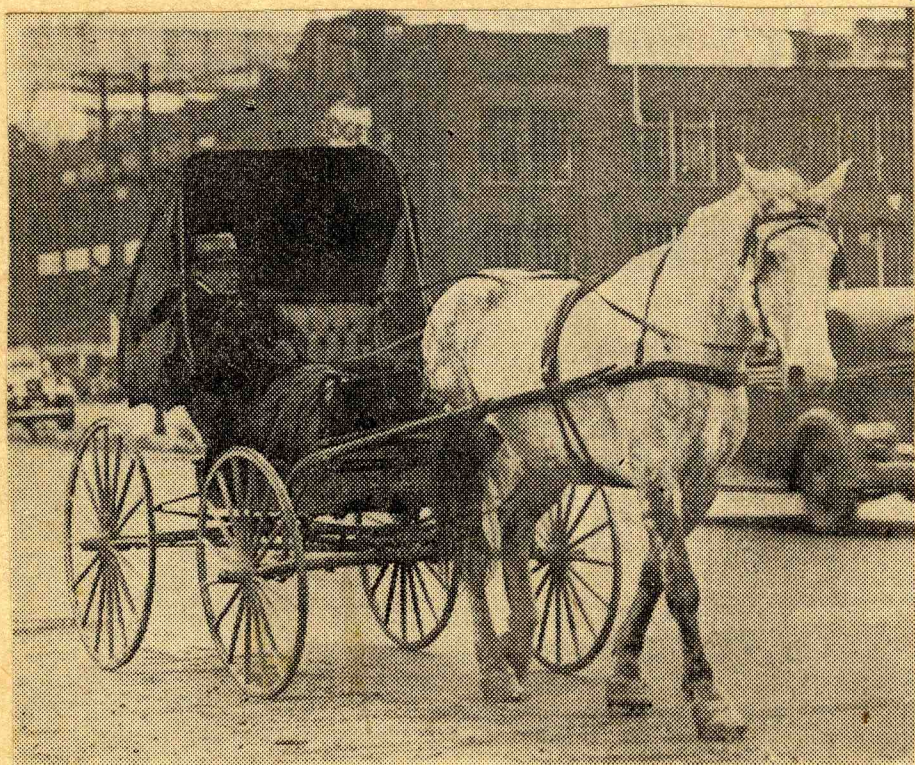
The old GREY MARE