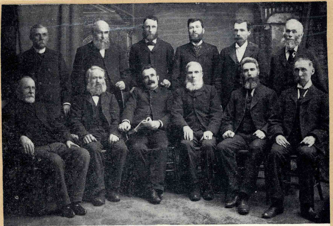
SESSION AND MANAGERS, 1902