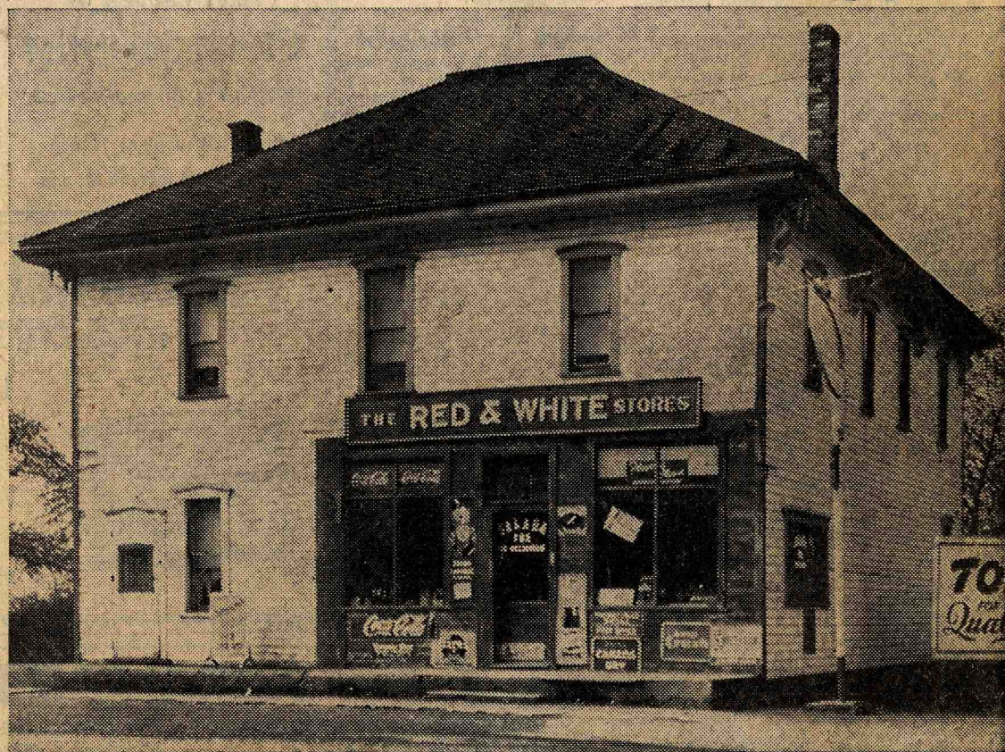
BUILDING AT JUNCTION OF HIGHWAYS 3 AND 4 TO MAKE WAY FOR SERVICE STATION

At one time there were four hotels in Talbotville, or what was then called Five Stakes. There were hotels on the southwest corner, where the new Reliance station is to be built; on the northwest corner, where a service sta-