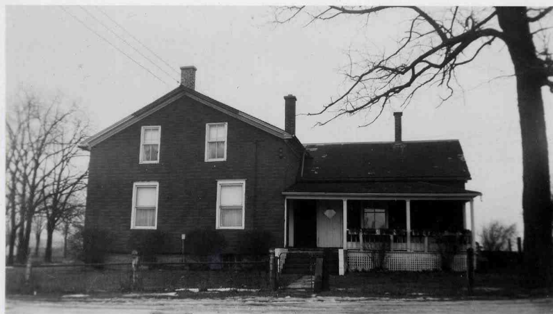
The Lawton Home.