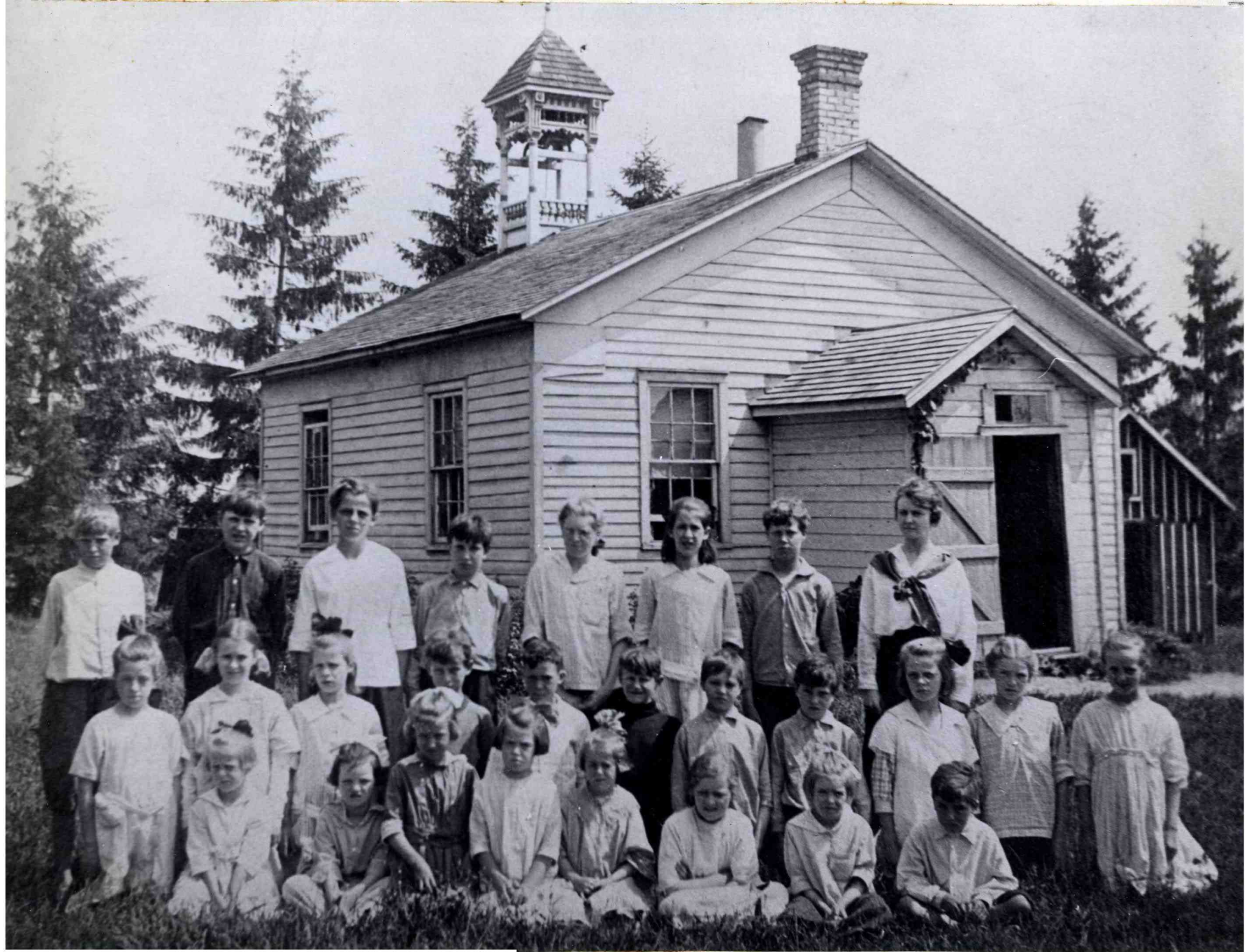
S. S. # 1.. White School.. 1909 - 1974..