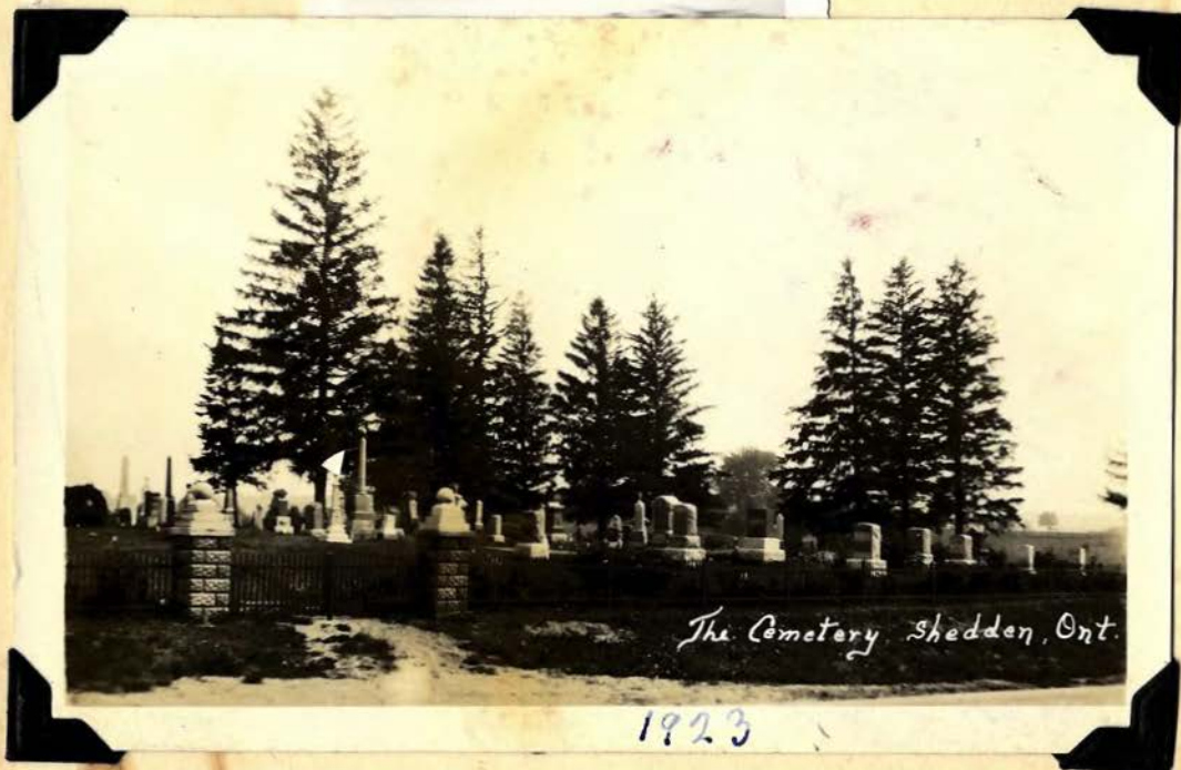
The Cemetery Shelden, Ont.