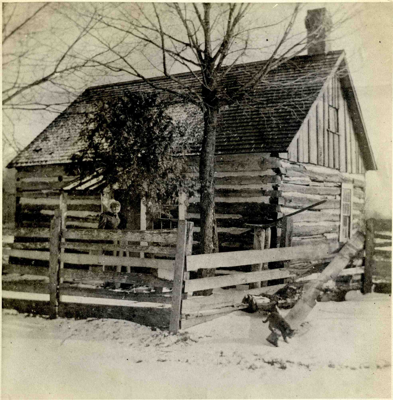
Lusty Home at Old Rodney (Centreville) 1864