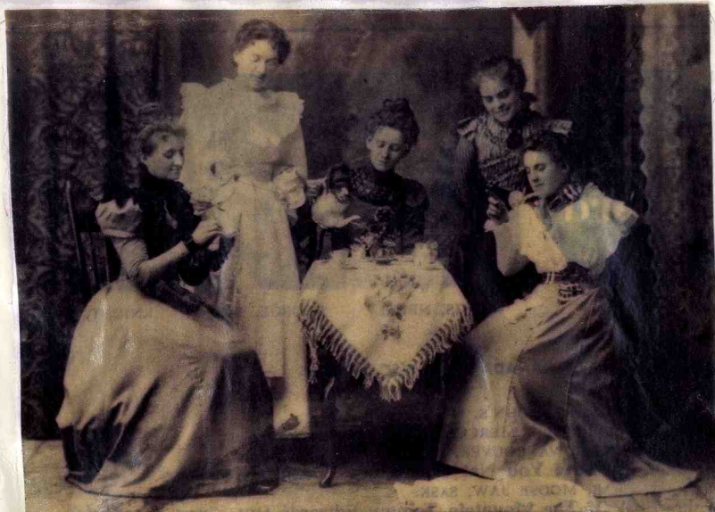
Ontario Tea Party: 1907