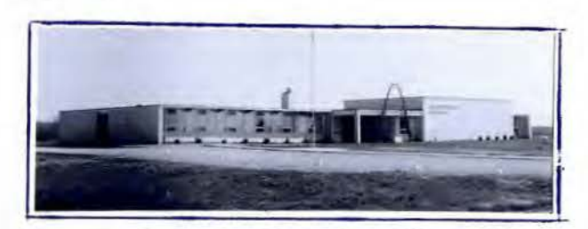
The South Dorchester Township School

A ten acre tract of land was bought from Earon Roberts about midway between the Crossley Hunter Corner and Highway # 73 on the north side of the read and during 1966 the new school was completed with classes beginning in it in September.