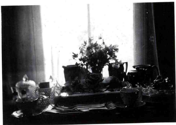
W.I. Display at L. E. Carrolls.