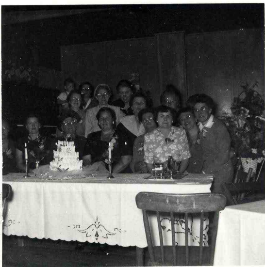
Iona Station Hall. 50 th Anniversary.