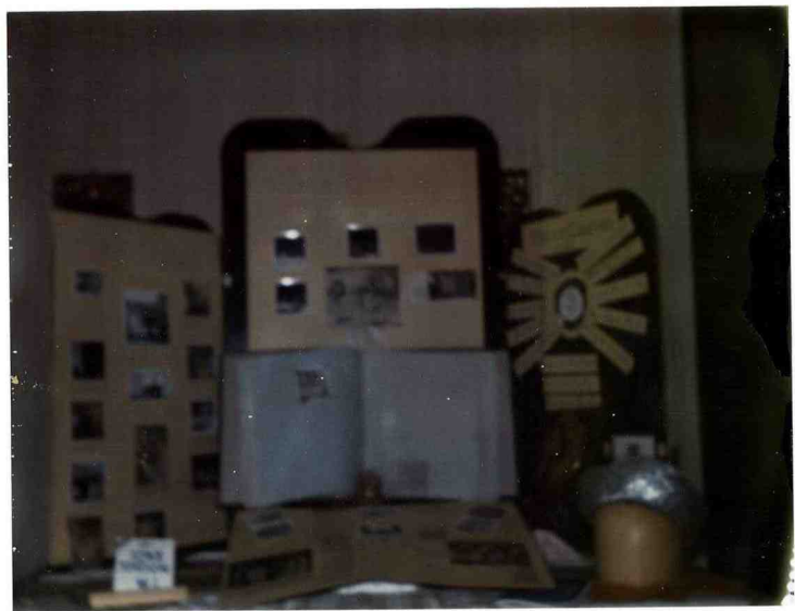
Iona Station W.C. display. at Grace United Church St Thomas. 50 th Anniversary of F.W.I.O. 1972.