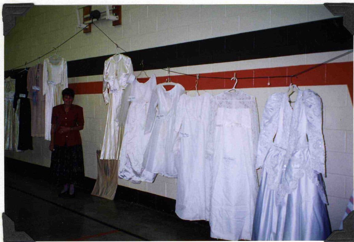
COLLECTION OF OLD WEDDING GOWNS