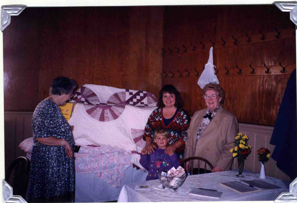
Daffodil Society Cancer Tea at Cowal Hall - Oct. 19, 1991