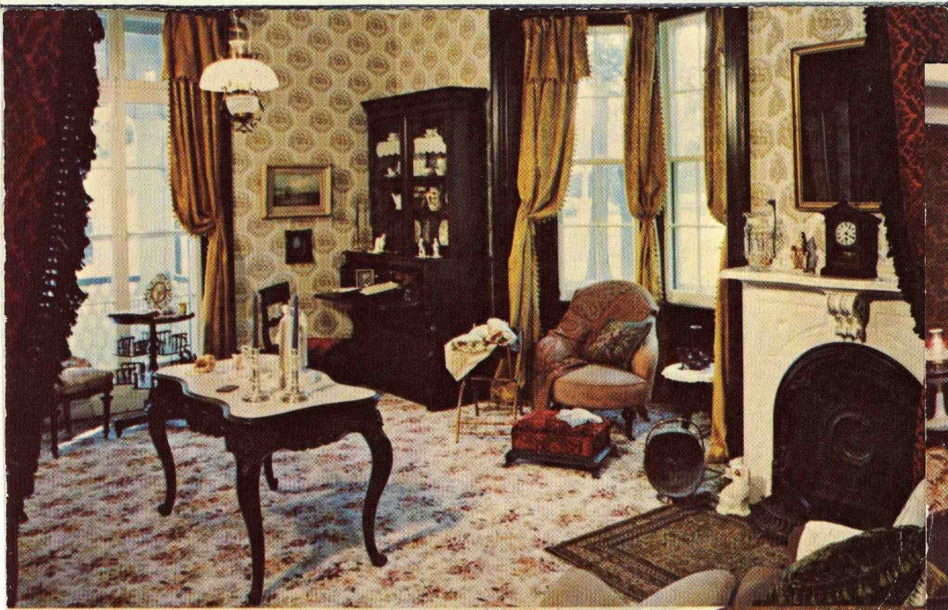
Living - Dining Room