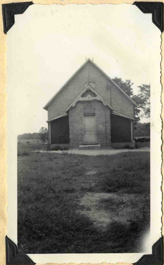
S. S. No. 14