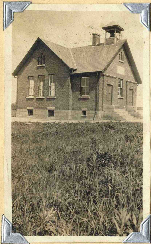
U. S. S. No. 3 now O. W. Community Hall.