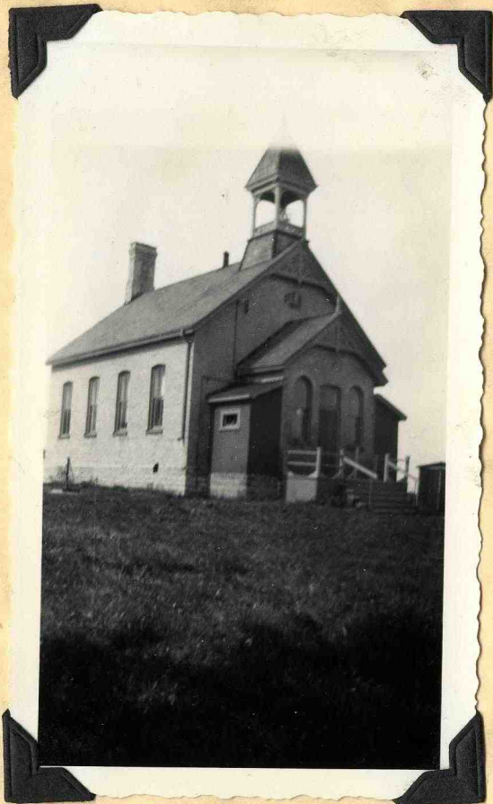
S. S. No. 9.