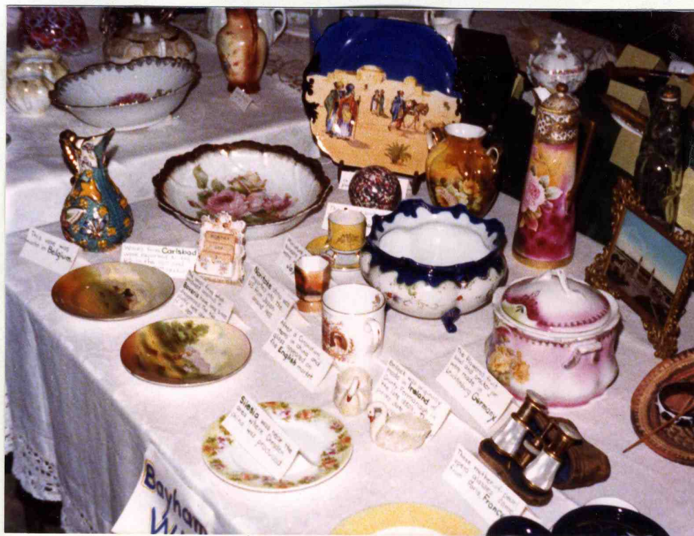
Bayham W.I. display at Aylmer fair

During the year the group also had a Penny Sale, Mystery parcels and a plant and food auction.